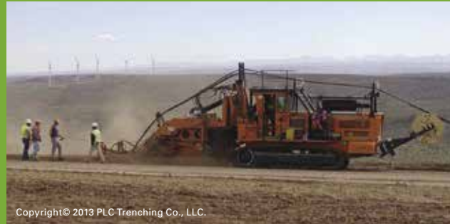
Copyright© 2013 PLC Trenching Co., LLC.

EmPowr Link CL Advantage is proven to maintain the same jacket stripping and coefficient of friction of a traditional EmPowr Link LLDPE jacket construction. Compact phase conductor and flat strap neutrals further reduce overall diameter and significantly improve durability for even easier installation and long-term reliability.